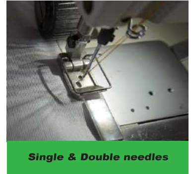
Single & Double needles