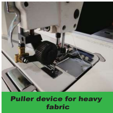
Puller device for heavy fabric