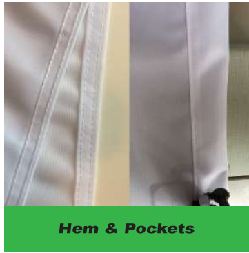
Hem & Pockets